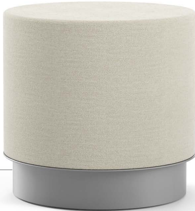
METAL BASE FINISH –